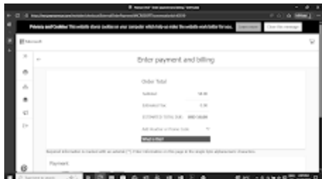
Screenshot (77).png 115K